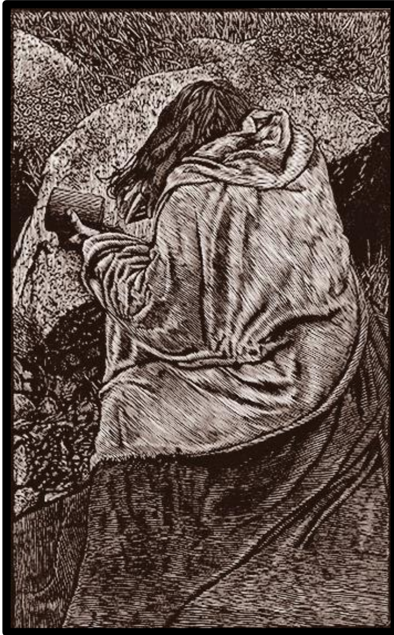
The Agony in the Garden, Barry Moser Pennyroyal Caxton Bible