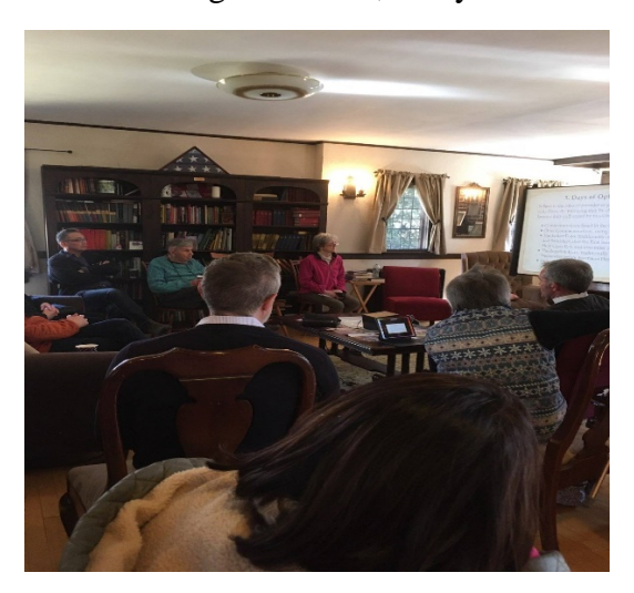
Our Lenten Adult Formation Series continues.