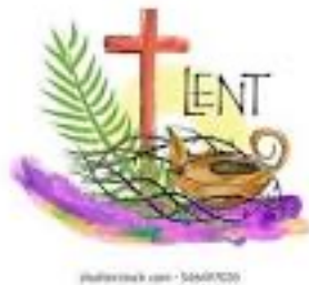
February 26, First Sunday in Lent Adult Lenten Series Begins