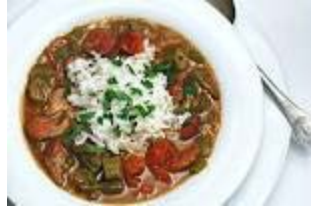
Sunday, February 19, 11am Gumbo for Shrove Tuesday