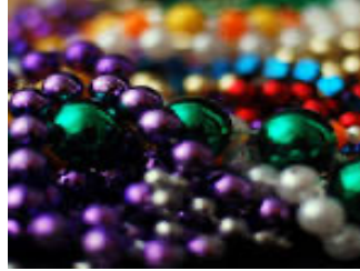
Tuesday, February 21, 6pm Shrove Tuesday Mardi Gras Dinner